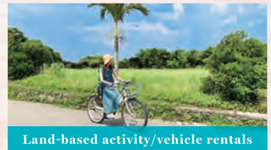
Land-based activity/vehicle rentals